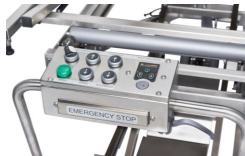
Control unit with forwards/backwards buttons

An additional electrical drive roller can be installed at the roller track of any lift and transport truck from our HTW 50/xxx and HTW 51/xxx range to automatically put a body tray off the truck onto the shelf. The drive roller is operated through forwards/backwards buttons at the control unit. The power supply is provided by means of the built-in battery.