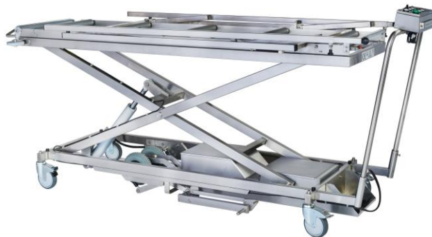
Lift and transport truck with drive roller MTR-RB 24V and traction drive FAT-HTW-24